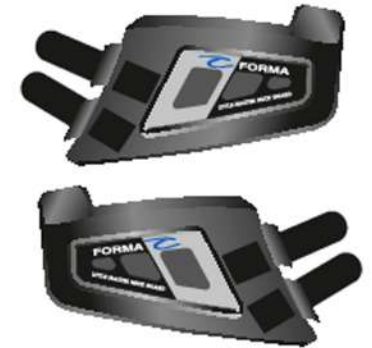
Little Master Neckguard