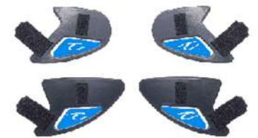
Forma Neckguard for helmets with SRS