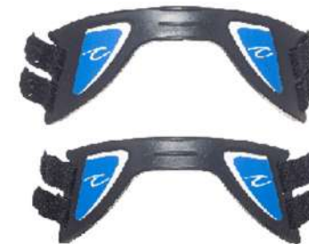
Forma Neckguard for helmets without SRS